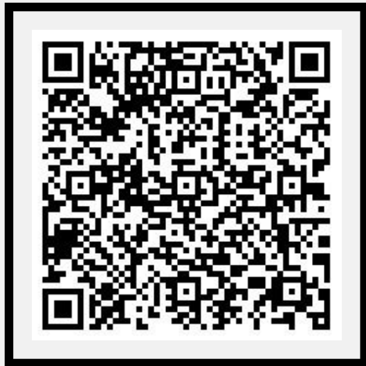
Scan QR Code